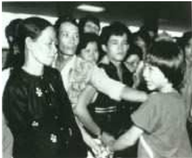
Fig. 1

Matter campaign has stood in opposition to countless instances in which clear hate crimes are not legally charged as such. This is particularly surprising given the rather large definition supported by the FBI: a hate crime is a “criminal offense against a person or property motivated in whole or in part by an offender’s bias against a race, religion, disability, sexual orientation, ethnicity, gender, or gender identity.” 1 However, even if the attacks of Hwang and the girl were not classified as hate crimes, it is undeniable that there was some implicit bias in choosing the victims - Asians and Asian-Americans are often targets because of assumed language barriers and a tendency for Asians to be more reluctant in reporting crimes. In either light, the Asian community is under attack; members of the community are unsafe simply by possessing racial markers.